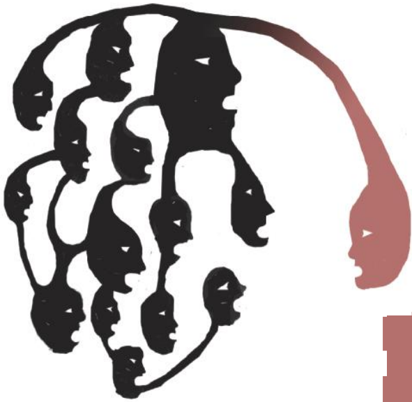
Illustration by Olle Havars

"Formerly tyranny used the clumsy weapons of chains and hangmen ... but in democratic republics ... it leaves the body alone and goes straight for the soul."